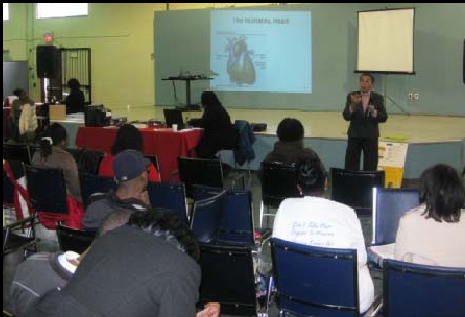
Heart Matters: Hypertension and Heart Disease in Blacks