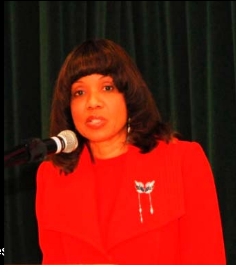
Minister of Health Promotion, Margaret Besant