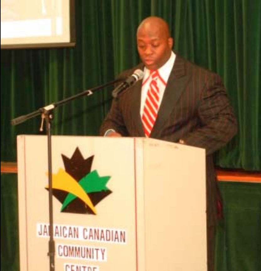
MC, Farley Flex